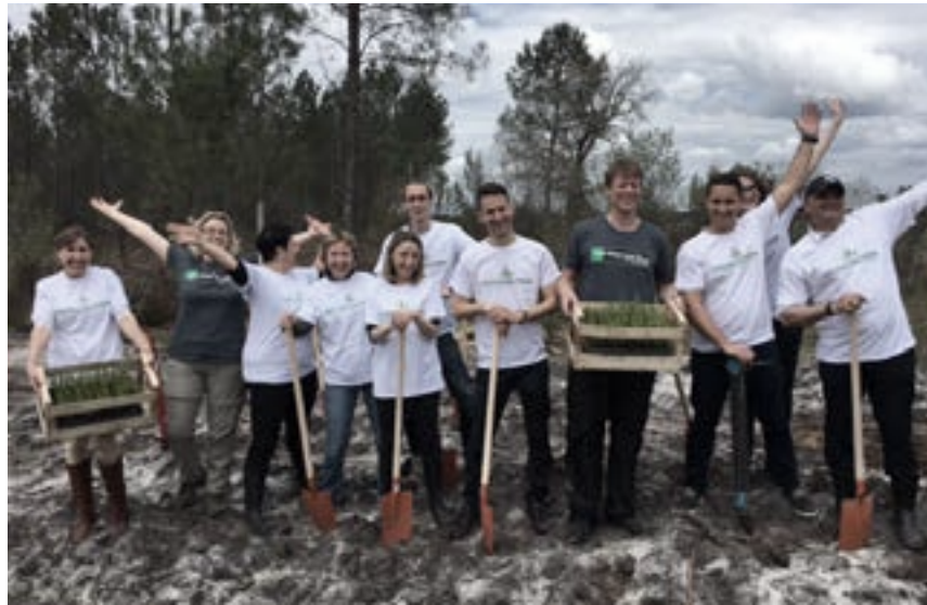
In May 2016, employees planted trees in France’s Landes Forest as part of Enterprise’s 50 Million Tree Pledge. Other 2016 plantings include California, Colorado, Florida, Germany, Manitoba, Michigan, New Mexico, Spain, Texas and the UK.

$27.3 million given in FY2016 by the Enterprise Holdings Foundation